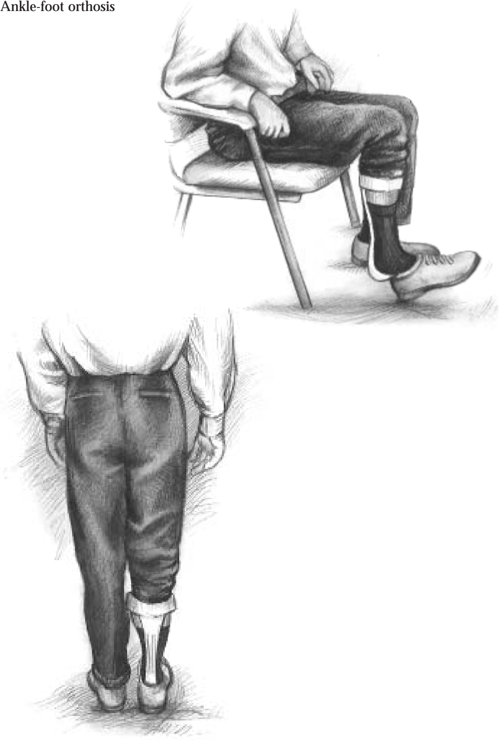
FIGURE 2 Ankle-foot orthosis