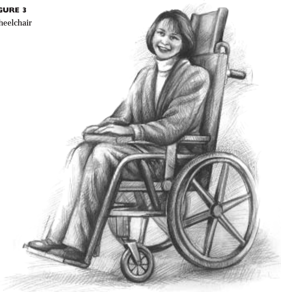
FIGURE 3 Wheelchair

Be sure to get the wheelchair from a medical equipment supplier who is familiar with ALS and supplies a rehab clinic, not a home care equipment supplier (who may just handle standard/pre-manufactured pieces). A rehab equipment retailer certified with National Rehab Tech Supplier has experience with customizing equipment to meet your individual physical size and medical needs.